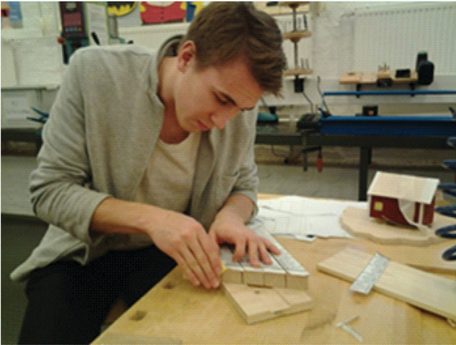
Figure 2. Blog 3: Concurrent process notes

The sandpaper technique works surprisingly well. The most important thing was to always sand diagonally downwards. (Blog 13).