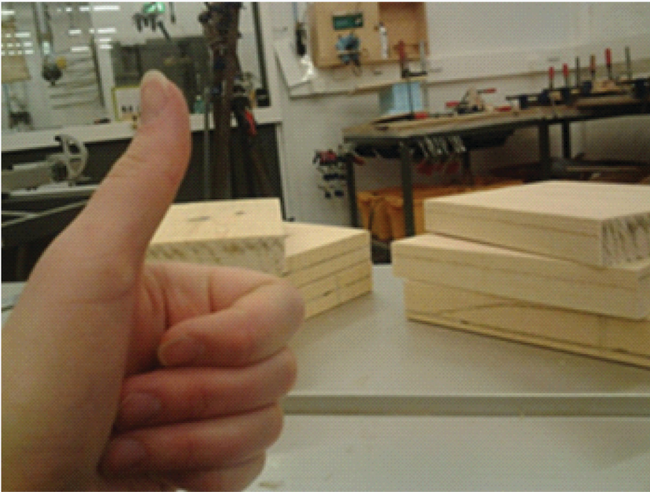
Figure 5. Blog 4: Sawing check

about uncertainty of the outcome of operations in the work process (category 6). Finally, some technology-related reflections were described in the students' documentations (category 7).