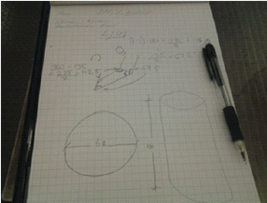
Figure 4. Blog 2

commented the application's ease of use in particular and also provided suggestions for technical improvement. The excerpt below, from Blog 4, describes a student's suggestion on how the usability of the microblogging tool could be improved.