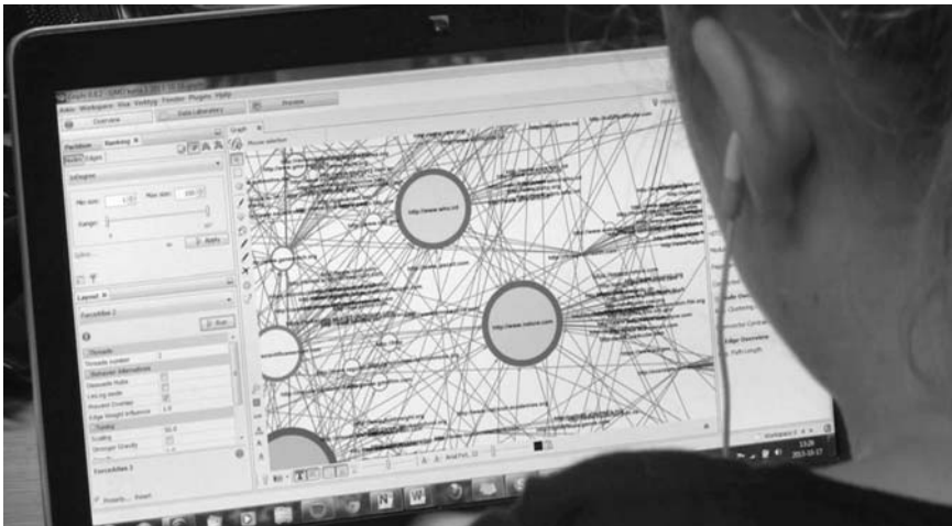
FIGURE 3.2 A student explores the nodes representing different actors in the controversy.

In the following we will present some empirical instances that emerged as tensions during this process. Such instances were identified from video recordings of groups of students as they worked with their controversies. Screen-capture software was used to record activities on one of the laptops of each group. The tensions were displayed by disruptions in ongoing work, such as hesitation or silence in a sequence of interaction flow or expressions of confusion or irritation with what was noticed or read on the screen. Such instances resulted in requests for clarification, seeking support from peers or asking the teachers for help. We are interested in exploring these tensions as instances of ambiguity and accountability, triggered by socio-technical interdependences. We also interpret from these instances underlying tensions of what normatively counts as relevant knowledge in this context, displayed through alternative ways of approaching issues of legitimacy.