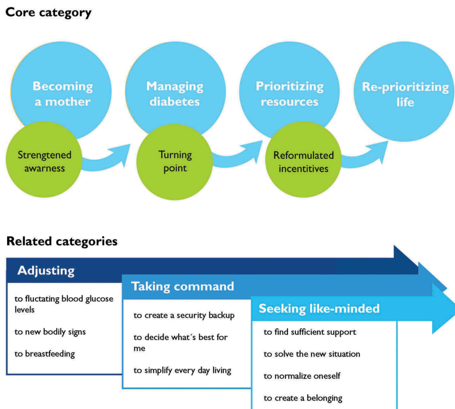
Figure 1. Conceptual model of the main concerns in early motherhood for women with type 1 diabetes and how they act to resolve their main concerns.

After birth the women experienced a radical reduction of insulin need. Especially in the very first days after birth it was common that the blood glucose levels fluctuated rapidly and often constituted hypoglycaemic episodes. Insulin doses had to be dramatically reduced, often to less than pre-pregnancy levels.