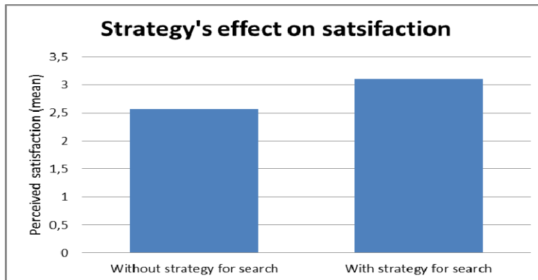
Figure 1. Relationship between the existence of a search strategy and the perceived satisfaction

Next, we turn to employee satisfaction as the dependent variable and hypothesis 3 (H3) which suggests: Having an explicit strategy for search affects the extent to which the employees are satisfied with their search applications. Figure 1 illustrates the different mean level of perceived satisfaction between organisations with a search strategy and those without. As seen in figure 1, the level of satisfaction is higher when a strategy for search exists.