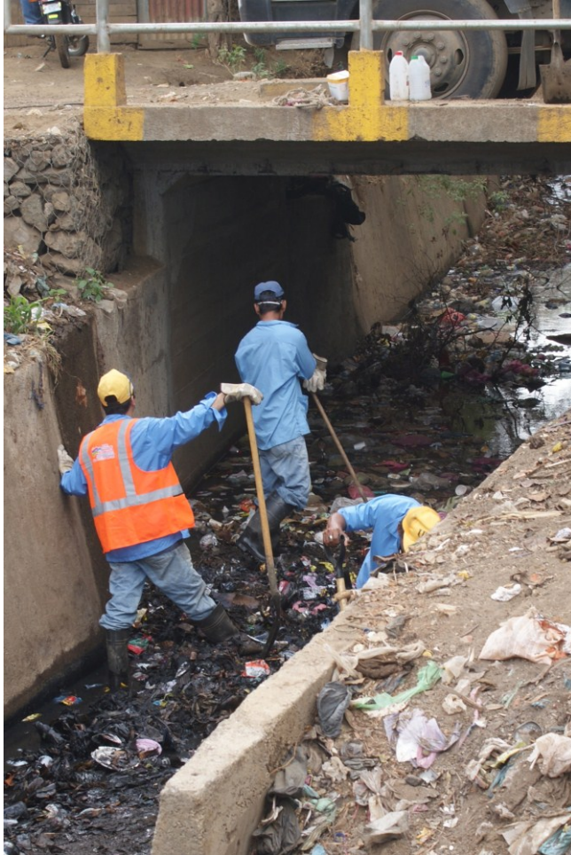
in a storm canal is being cleaned in preparation for the rain season