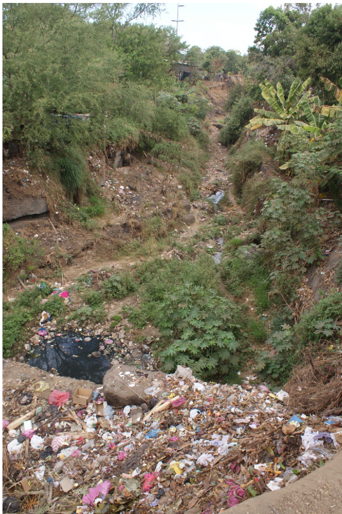
Photo 3. River bank with illegally dumped waste

Even in informal settlements that are accessible to modern compaction trucks, the waste collection service is reportedly very irregular and unreliable. 22 In 2010 in Managua districts 6 and 7, it was estimated that 33 percent of households were not served at all by official municipal waste collection, while the service provided to other households was inadequate. 23