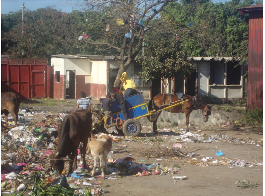
Photo 7. Horse cart-man from Manos Unidas at the temporary waste transfer station

that waste transfer stations are very vulnerable arrangements that require well-established connections and coordination, since they depend completely on municipal services for regular waste removal.