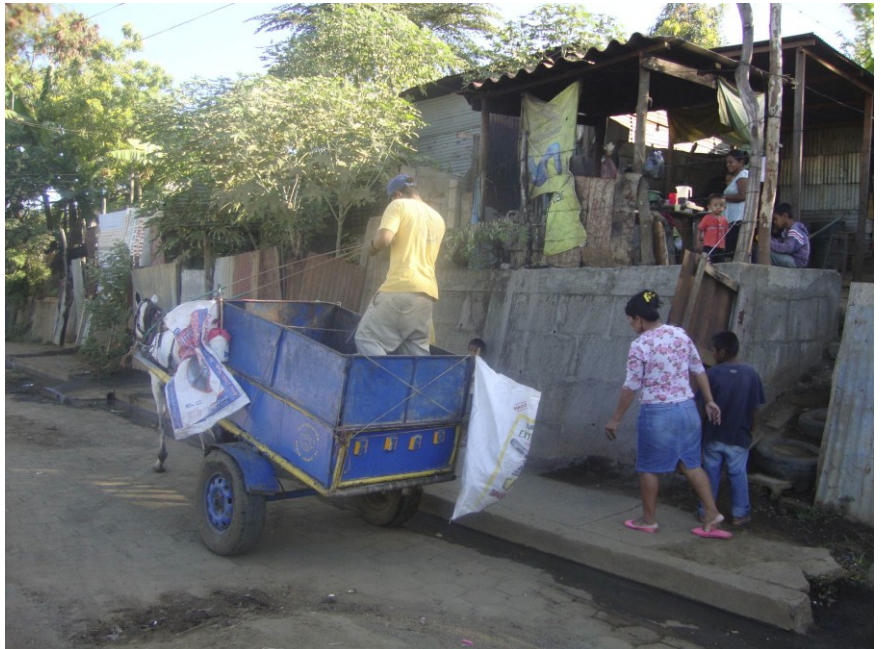
Photo 6. Horse cart-man from Manos Unidas collecting waste

The first week that Manos Unidas collected the household waste, almost no residents used their services. The carts were empty. “For 3 Cordobas [approximately EUR 0.10] I would rather dump the waste in the river!” said many. But there was an awakening after community leaders started visiting the barrio, household by household. And this is how awareness was raised. Every project, if it has good community leaders, will work. 24