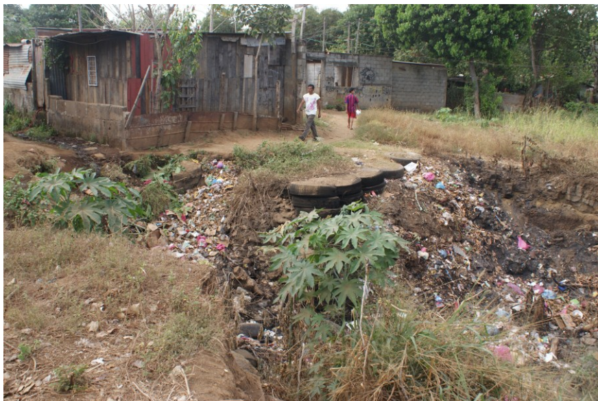
Photo 5. Informal settlement with clandestine dump, District 5, central Managua

city of Managua is. They just do not know the reality at the informal settlements. For example, in many pulperías [local stores] horse shoes and horse food are sold,” making it obvious to those who choose to look that horses and therefore cart-men are operating in the city. The institutionalized dimension of the informal waste practices in the spontaneous settlements was largely unseen by city authorities, but familiar to local NGOs like Habitar which had been implementing other waste infrastructure projects in the barrio for several years.