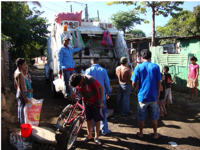
Photo 2. Compaction waste truck on a dirt street in an informal settlement where it can enter. Note the low cables, and the hanging sacks on the back of the truck containing sellable recyclables that the workers have sorted out while collecting

Photo 1. Narrow street where the compaction trucks cannot enter due to low hanging cables, trees and the condition of the street